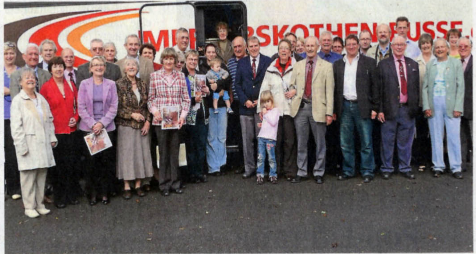
Eine erlebnisreiche Englandreise liegt hinter den Crawley-Freunden.

Etliche der Vorstandsmitglieder aus Crawley sind in dieser Kirchengemeinde aktiv. Am Sonntag wurden beim Dual Committee Meeting das abgelaufene Jahr sowie der Plan für das nächste Jahr besprochen und festgelegt: 2010 waren mehrere Grup-