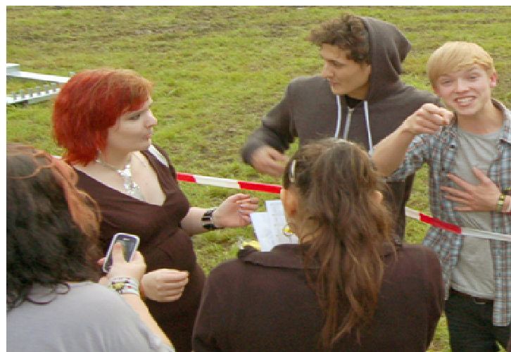
Press to Meco